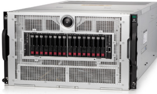
FIGURE 1. HPE Apollo 6500 Gen10 Plus system